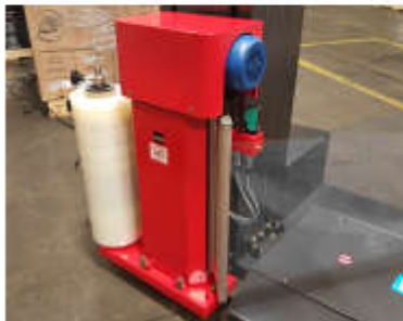
Film Carriage Assembly